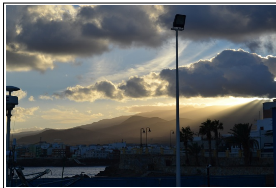
Sundown in Muelle de Taliarte.

With only a few days left before we were ready to launch the travel lift had a serious mechanical break down. A gearbox in one of the four hydraulically driven wheels crashed and oil started leaking. There was no possibility to move the travel lift with one wheel locked so the only possibility was to repair it where it was. It took two days.